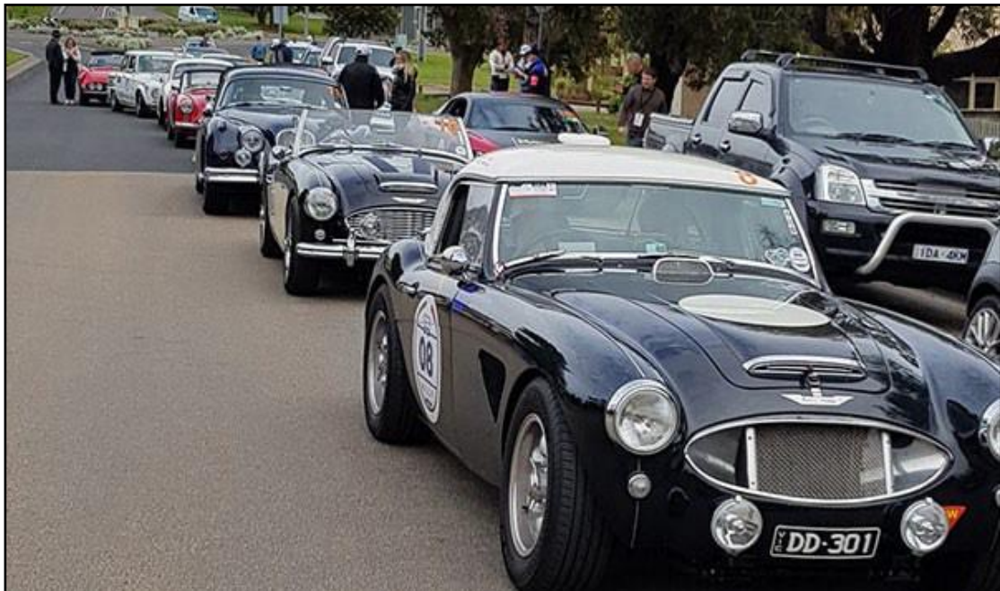
2019 La Corsa Scuderia (Team) Winners – Team Europeans